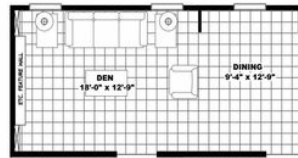
3BR-2 BA. OPT.